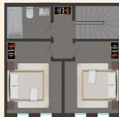
DUPLEX FIRST FLOOR